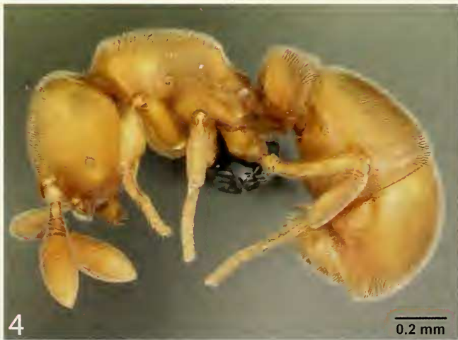
FIGURE 1-4. Discolityrea berlita worker: holotype CASENT0007016.